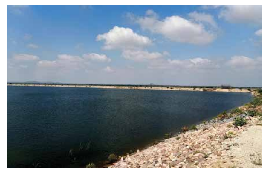
2074 Million Litre Raw Water Reservoir, Sindhanur, Karnataka

In business terms, we are monitoring the supply chain to ensure availability of material at our project sites, getting the workforce back, monitoring the emerging business scenario due to liquidity crunch and mismatch cash flow and taking every possible step to mitigate the crisis.