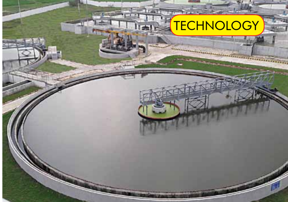
42 MLD Sewage Treatment Plant, Kanpur

Urine is part of domestic wastewater which contains up to 90 per cent of the nitrogen and 50 per cent of the phosphorus. The development of urine separating toilets and technologies for treating it to produce fertiliser products is a key to managing nutrients with minimal requirements for outside resources, such as additional energy. Producing the same amount of