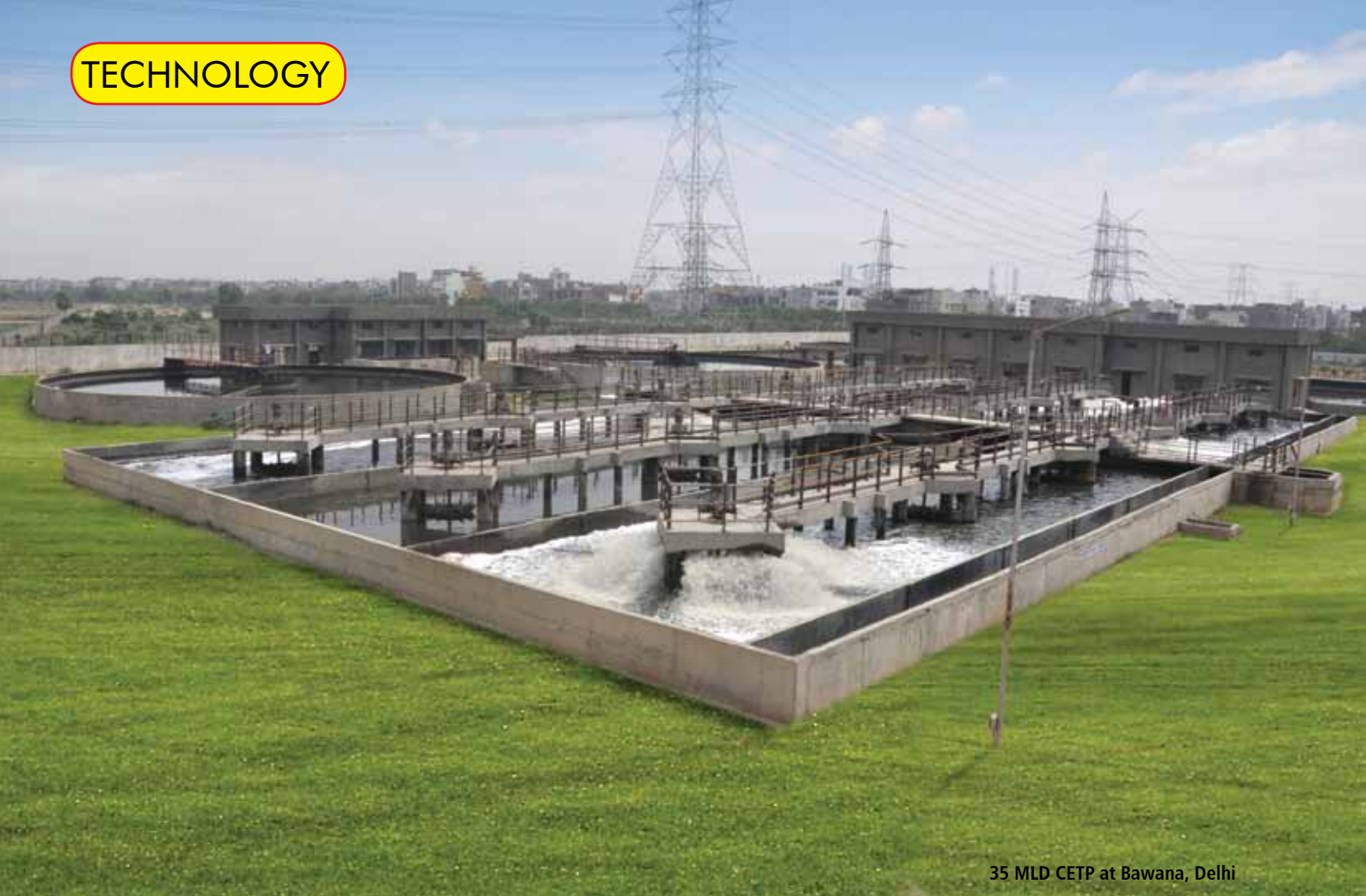
35 MLD CETP at Bawana, Delhi

efficient pumping and energy-recovery systems will be possible.