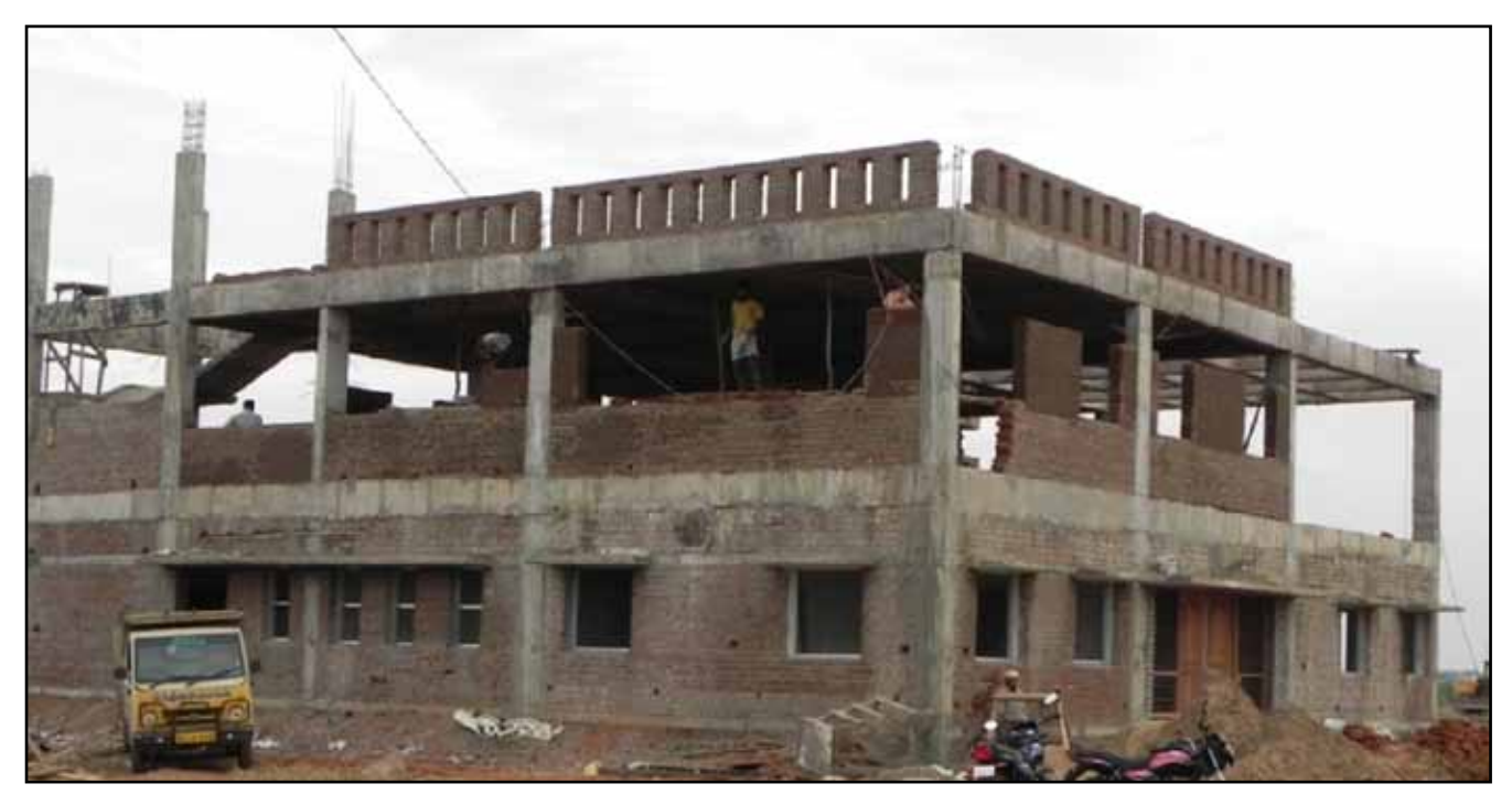
Admin Building: Internal Plastering for Ground Floor Over, First Floor Brick Work is in Progress.