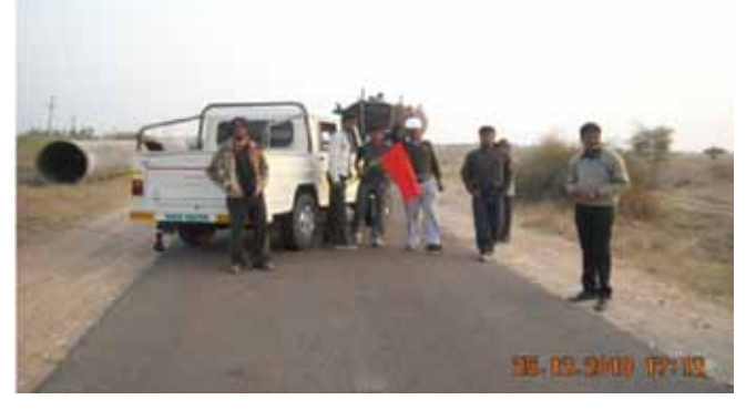
Signal System for traffic & people control inside the prohibited area at both ends.