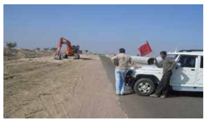
Signal System for traffic & people inside the prohibited area at both ends.