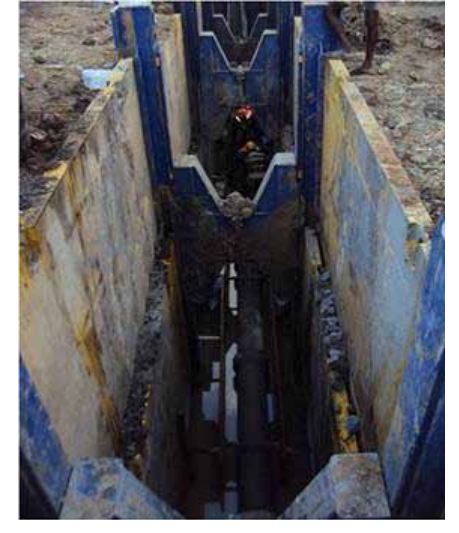
Photograph shows use of imported shoring material from SBH, Germany during laying of pipeline for the safety of workmen due to unstable strata

We have achieved progress of 22.40 Crore in January 2011 in one month