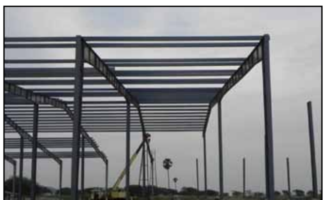
Monsoon Shed – Column Erection Complete, Rafter and Purlin Erection in Progress