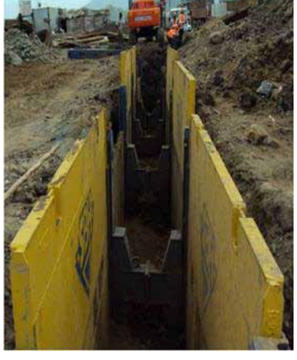
Photograph shows removal of shoring material after laying of pipeline is over