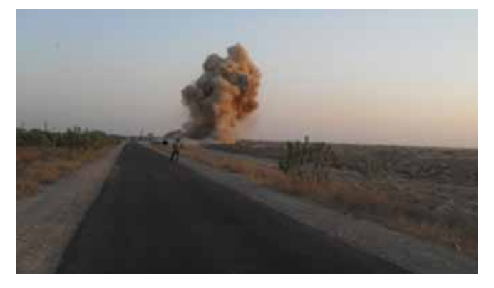
During Blasting process prohibited area is evacuated for any probable mishap.