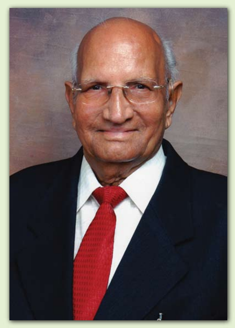
We are inspired by our guiding light