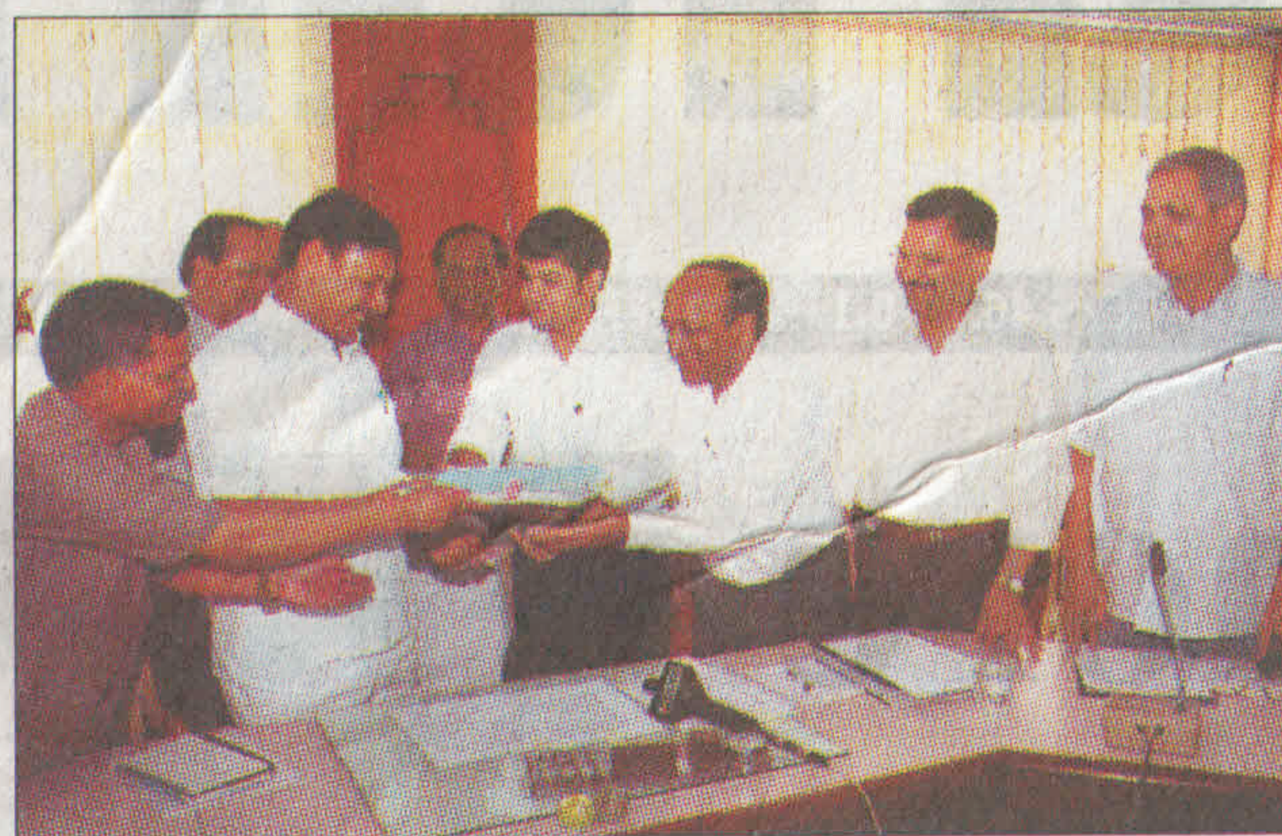
■ (2nd left) PWD minister Pramod Jain 'Bhaya' signs an MoU for a road development project in Jaipur on Monday.

For the project, the Centre will give a subsidy of Rs 44 crore, while the state government will provide a subsidy of 20 per cent (Rs 44 crore). This apart, the state will also provide Rs 18 crore for land acqui-