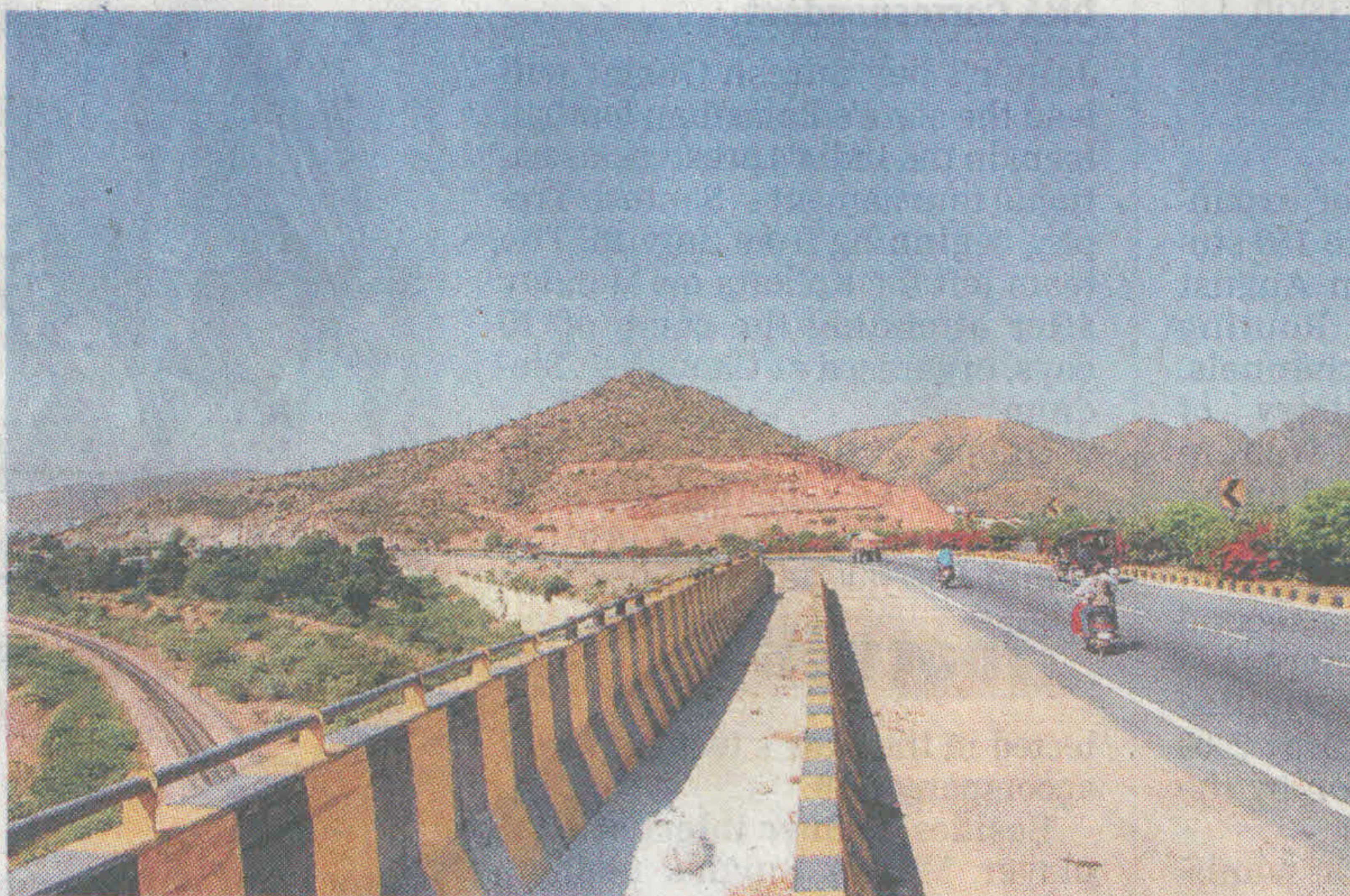
CONNECTING PLACES: Eleven projects each for development of national and state highways will improve the state's connectivity