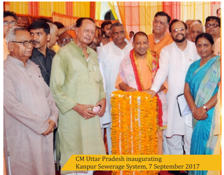
CM Uttar Pradesh inaugurating Kanpur Sewerage System, 7 September 2017