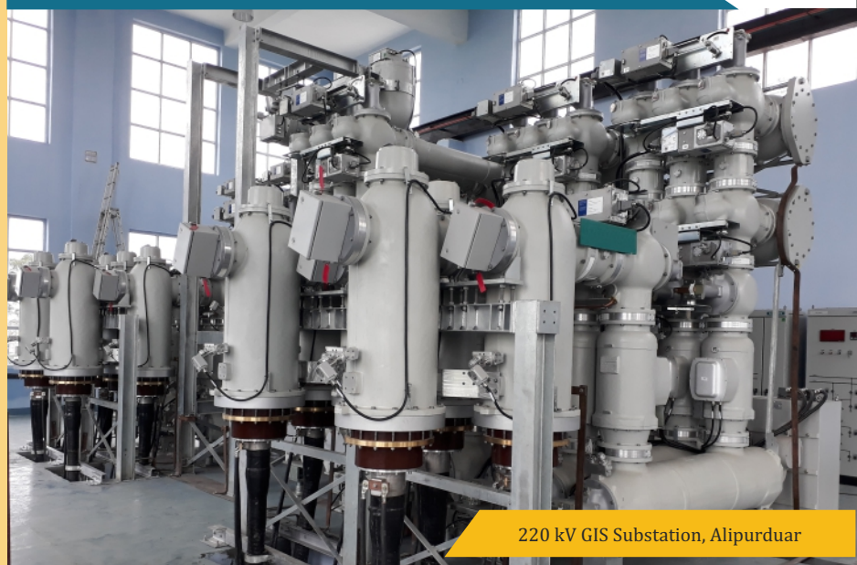
220 kV GIS Substation, Alipurduar

The construction and erection work of 220 Kv Gas Insulated Substation (GIS) is completed in Alipurduar, West Bengal with the charging of the system on 31st August, 2017. The GIS Substation is technologically advanced and more reliable than the traditional air-insulated substations (AIS) as it uses a superior dielectric gas, SF 6 , at moderate pressure for phase-to-phase and phase-to-ground insulation. It is an automated system that could be controlled from a computer; is compact and lesser space is required for installation; and is maintenance free for next 20 years. The project will help our client, West Bengal State Electricity Transmission Company Limited to provide accurate voltage level of power supply in the designated areas. SPML Infra is executing a similar project in Sikar, Rajasthan.