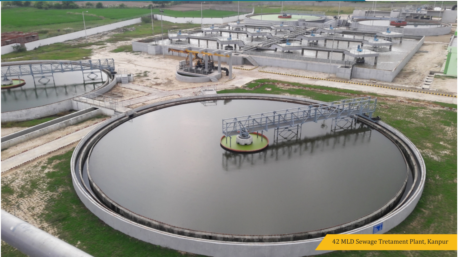
42 MLD Sewage Treatment Plant, Kanpur