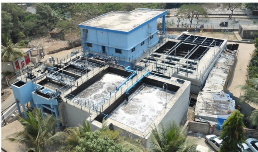
11 MLD Decentralised Sewage Treatment Plant at Mira Bhayandar