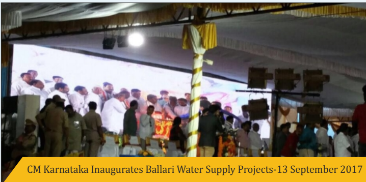
CM Karnataka Inaugurates Ballari Water Supply Projects-13 September 2017

Hon'ble Chief Minister of Karnataka, Shri Siddaramaiah has inaugurated water supply scheme for 3 zones namely - Gonal, Raghavendra Colony, and Vajpayee Layout having 1203 household connections under Ballari Water Supply Project on 13th September, 2017. SPML Infra is proposed to complete phase -1 (28 Zone) having 50,253 connections of the city area by April 2018.