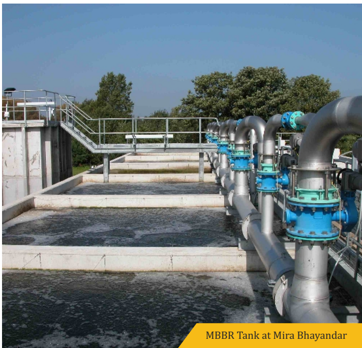
MBBR Tank at Mira Bhayandar

Microbial fuel cells is a breakthrough technology where electrical energy could be extracted directly from organic matter present in the waste stream by using electron transfer to capture the energy produced by microorganisms during the wastewater treatment. This technology is still in its development stage and significant advances in process efficiency and economics will be necessary before it could be used widely to produce electrical energy directly from organic matter present in the wastewater.