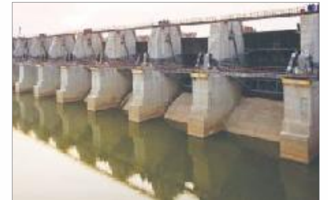
Hydro Mechanical Work, Gosikhurd Barrage, Maharashtra