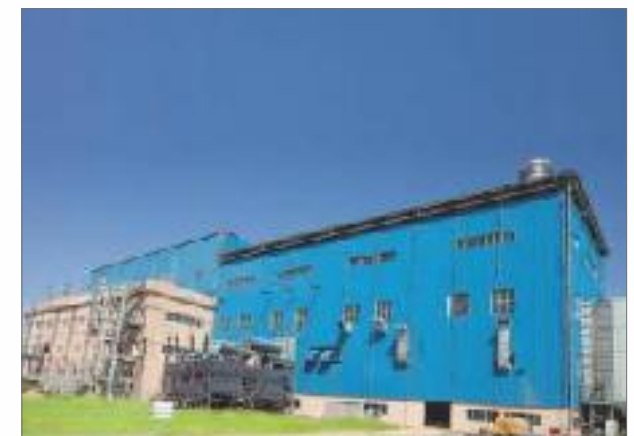
STG & GTG Building at Ramgarh