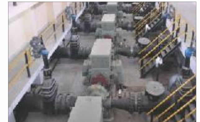
Rithala Effluent Pumping Station, Delhi