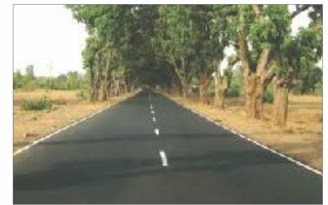
87 kms State Highway, Jamui, Bihar