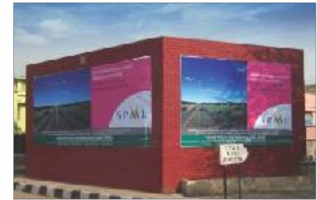
Waste Collection Centre in Delhi