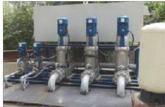
Water Pumping Station, Delhi