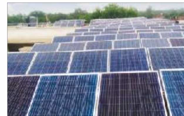
100 Kw Solar Power Plant-DPS, Varanasi