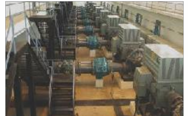
500 MLD Water Pumping Station, Bangalore