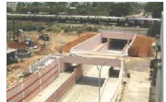
Rail Under Bridge, Chennai, Tamil Nadu