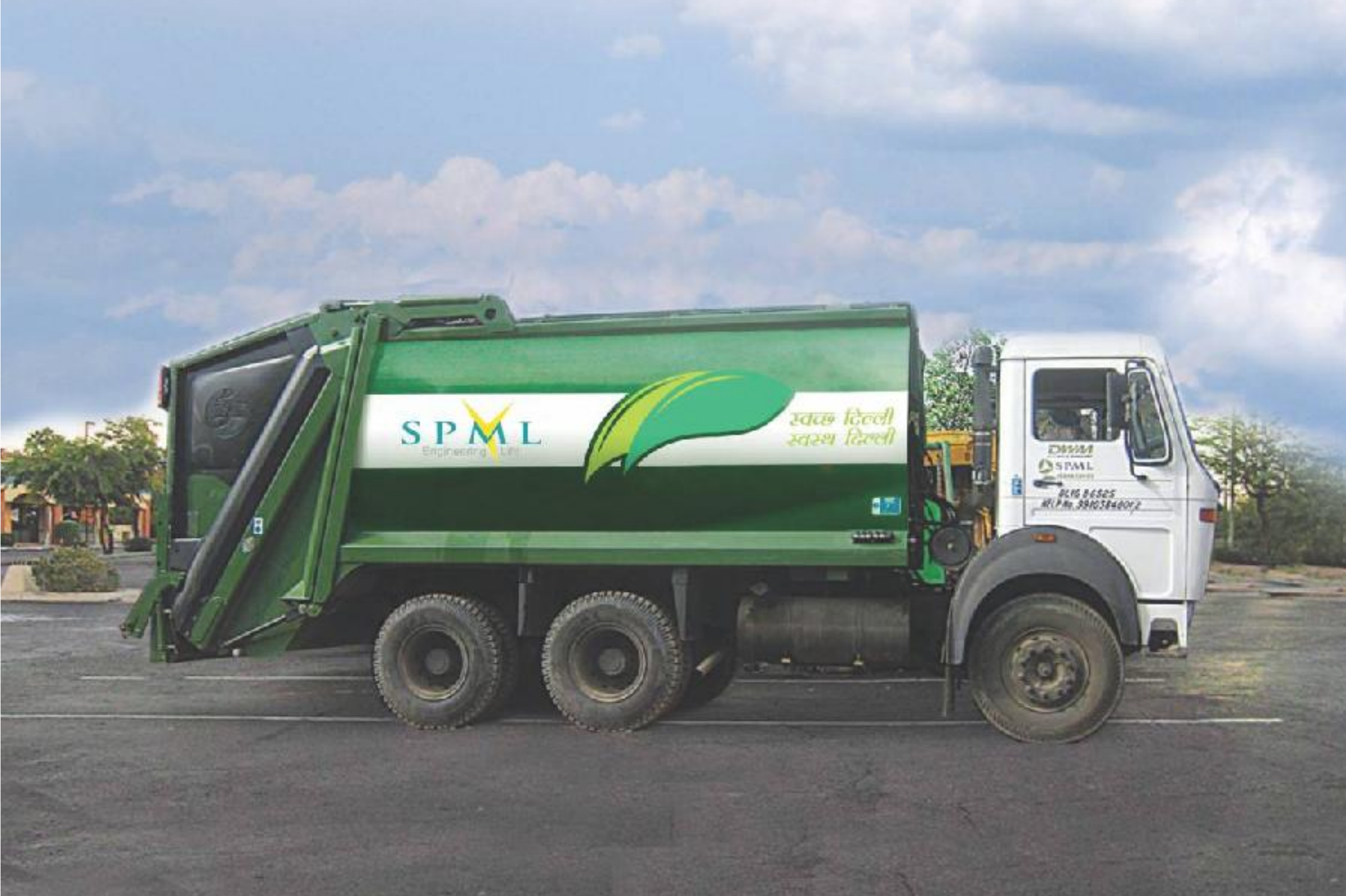
Municipal Solid Waste Collection Vehicle