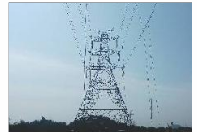
400 kV Twin Moose Transmission Line, Bhilwara, Rajasthan

SPML is among the largest contributor of power transmission & distribution in India. Millions of households across the country have benefited through SPML's power transmission and distribution initiatives. In order to meet growing requirement, high capacity transmission corridors comprising 765 kV AC and \pm 800 kV 6000 MW HVDC system along with 400 kV AC and \pm 500 kV/600 kV 2500 MW/6000 MW have been planned to facilitate transfer of power from remotely located generation facilities to bulk load centres. The focus is on the technological requirements for development of future power system with upgrading of existing transmission system, adopting technology suitable for bulk power transfer over long distances like high capacity EHV/UHV AC system, HVDC system, compact tower/substation, mitigating devices to address high short circuit level, intelligent grid etc.