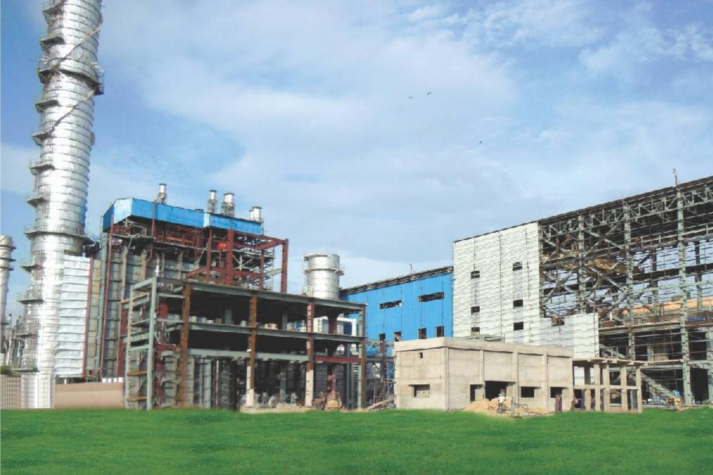
160 MW Thermal Power Plant Stage-III at Ramgarh, Rajasthan