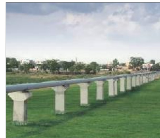
Water Supply Pipeline in Rajasthan

SPML has established itself as a reliable, and preferred partner in infrastructure development with state and central government and municipal bodies across the country. SPML spearheads, develops and manages infrastructure projects like Ports, SEZs, Integrated Industrial Townships, Urban Infrastructure, Automated Car Parking Solutions, amongst other mega infrastructure projects.