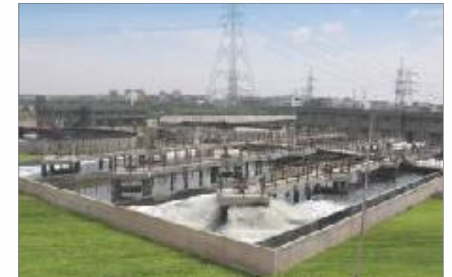
35 MLD CETP at Bawana, Delhi