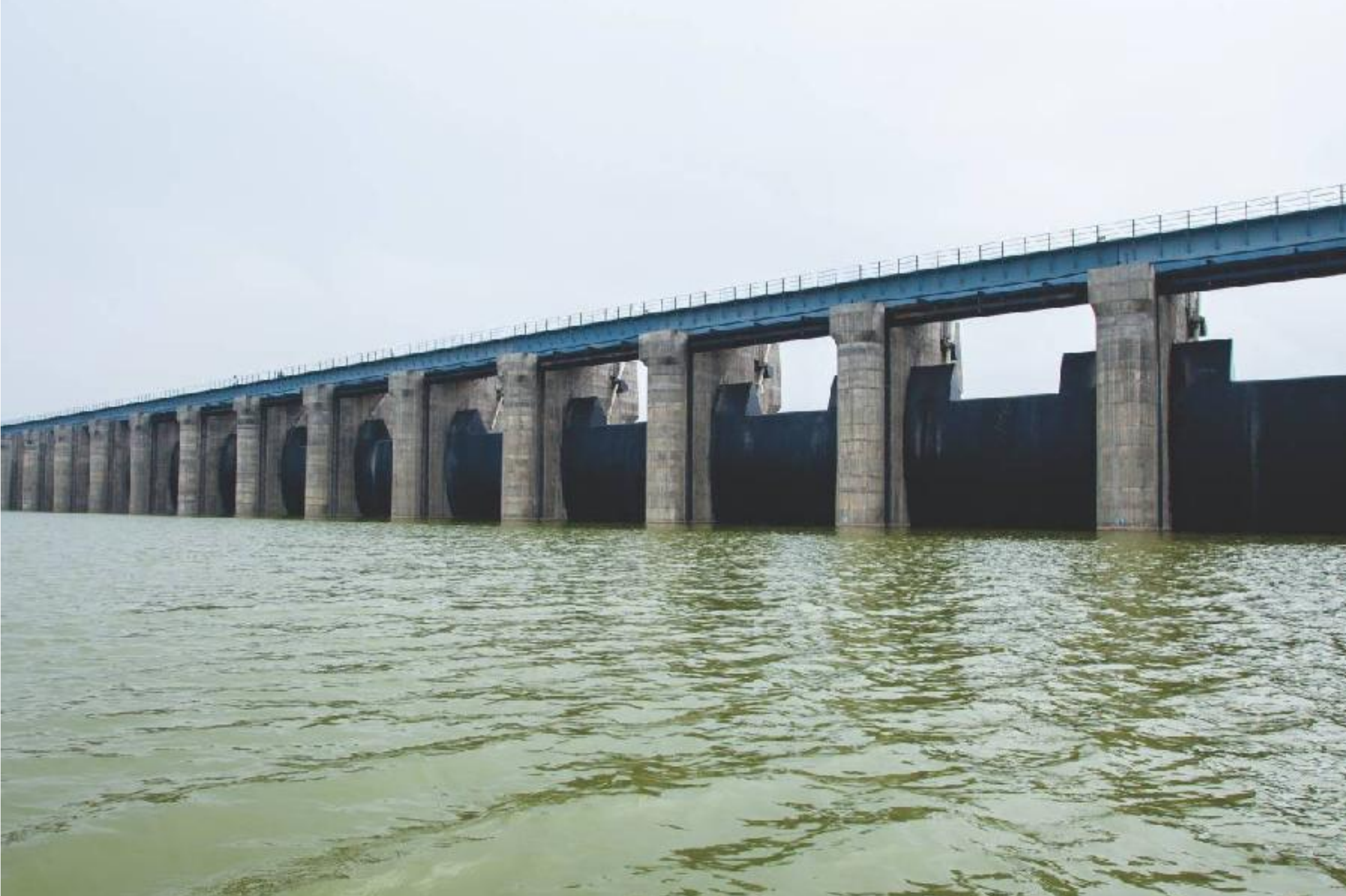
Concrete Gravity Dam, Kalisindh, Rajasthan