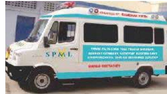
Mobile Healthcare Services for Economically Weaker Sections