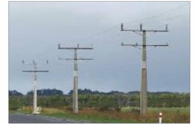
11 kV Feeder Separation Line, Jabalpur, Madhya Pradesh