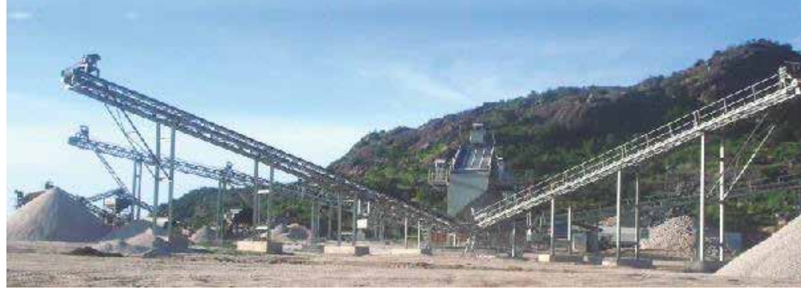
Stone Crusher Plant