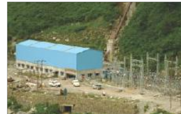
4.5 MW Iqu Hydro Power Project, Himachal Pradesh