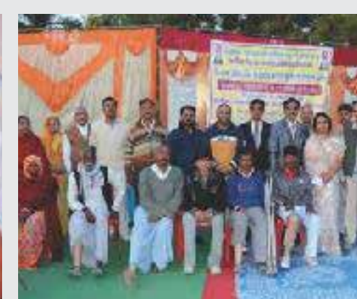
Limb Distribution Camp at Sonagir, Madhya Pradesh