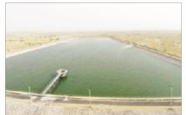
300 million liters Raw Water Reservoir at Pokhran, Rajasthan

SPML is a leading player in Indian water segment with rich experience in executing turnkey water projects including extraction, pumping, treatment, transmission, distribution and metering with innovative technologies.