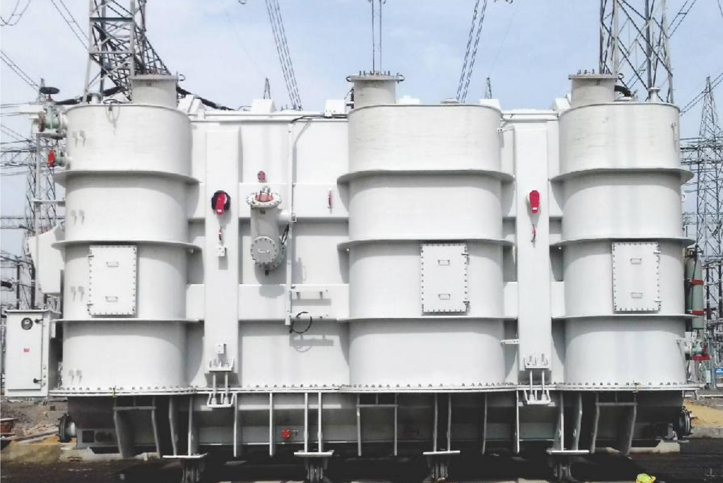
500 MVA Autotransformer, Sikar, Rajasthan