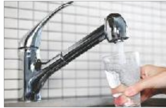
Drinking Water Supply