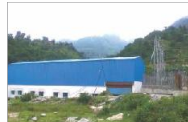
4.5 MW Neogal Small Hydro Power, Himachal Pradesh