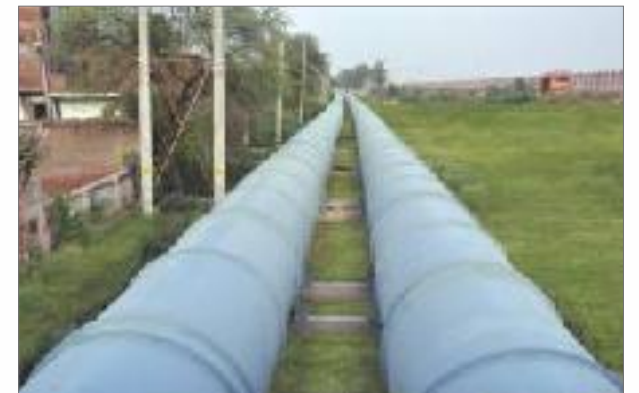
2420 MM dia twin Water Pipeline at Wazirabad, Delhi