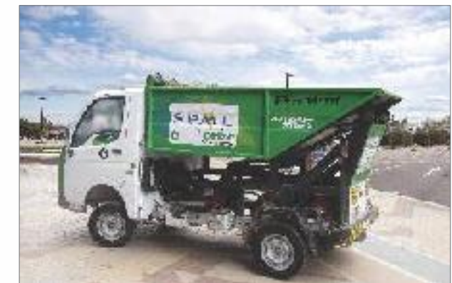
Small Tipper Waste Collection Vehicle