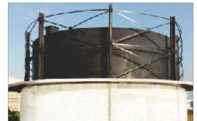
600 Cum Gas Holder at STP, Nasik

SPML offers complete life cycle solution in wastewater treatment, common effluent treatment, water recycle and reuse including design, engineering, construction and commissioning and using new generation technologies such as Membrane Bio Reactor (MBR) and Moving Bed Bio Reactor (MBBR) that can treat the wastewater to the quality of river water. SPML has a track record of executing large and complex projects and help industry to meet the industrial wastewater regulations while improving efficiency and reducing waste disposal.