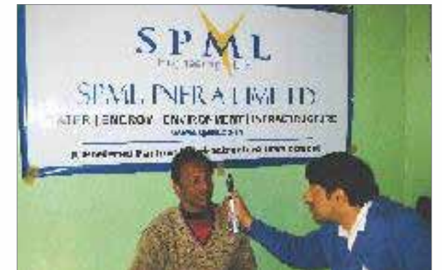
Eye Care Camp, Delhi