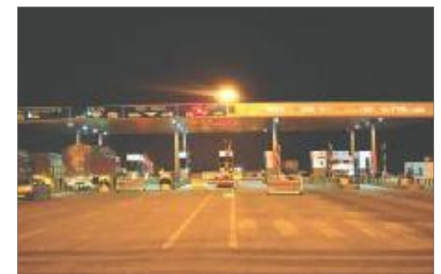
127 kms Jaora-Nayagaon-Toll-Road, Madhya Pradesh