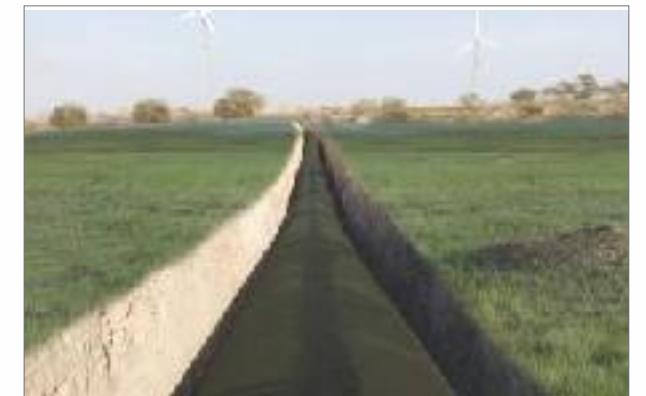
3000 MM Dia MS Pipeline, Sauni Yojana, Gujarat