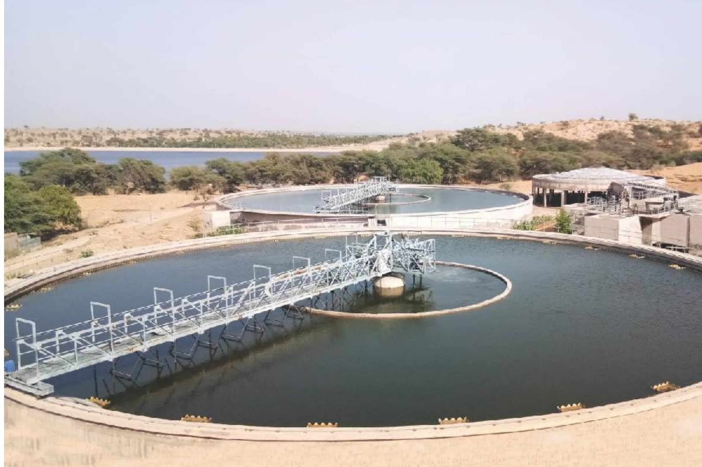
160 MLD Water Treatment Plant, Dhannasar, Rajasthan