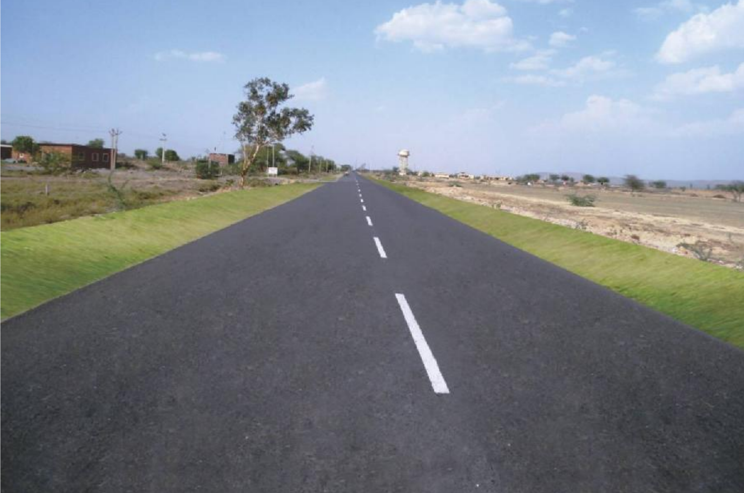
212 Kms Jaipur - Bhilwara Toll Road