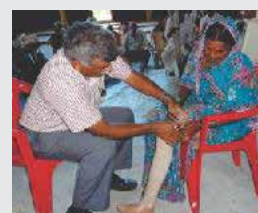
Artificial Limb Distribution