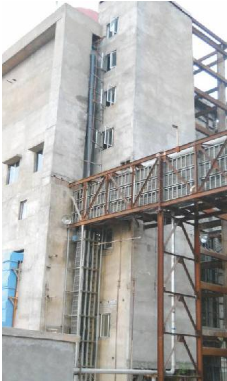
EPS Building, Korba, Chhattisgarh