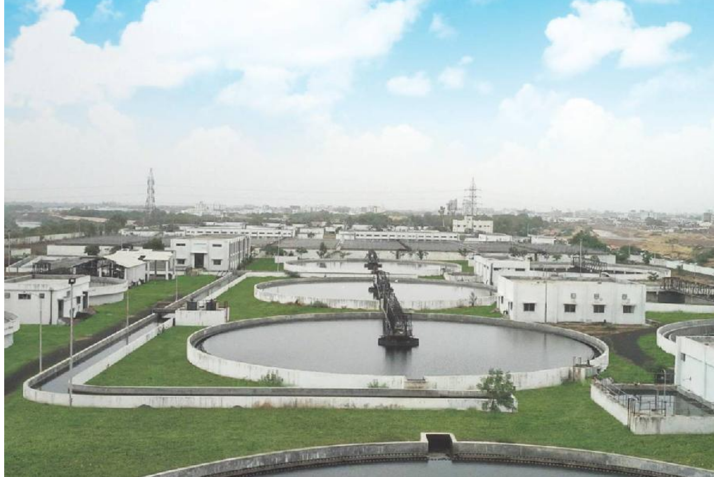
240 MLD Sewage Treatment Plant at Vasna, Ahemdabad