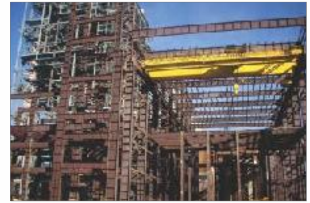
Thermal Power Plant at Korba, Chattisgarh