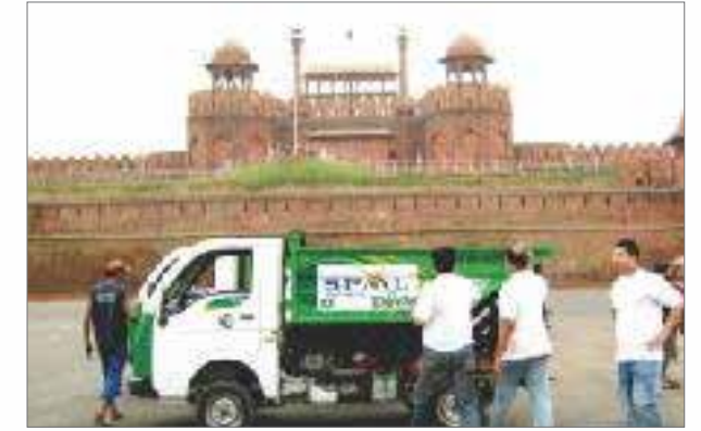
Cleanliness Drive of Historical Monuments-Red Fort, Delhi

SPML's non-profit charitable organisations are striving to protect, preserve and promote environmental sustainability, provide education and healthcare facilities to the economically weaker sections of the society.