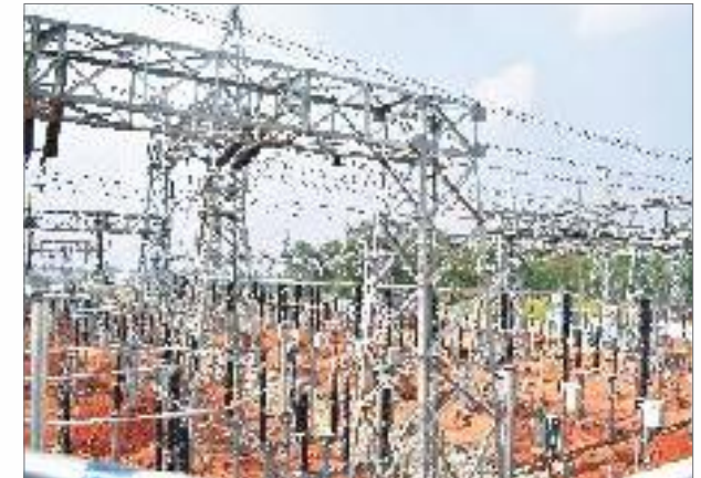
220 kV Grid Substation, Ratu, Jharkhand