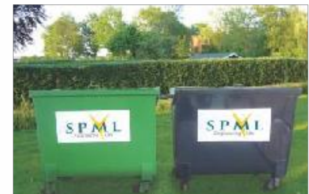
Waste Collection Bins

SPML is a leader in the management of municipal solid waste collection, segregation, processing and recycling, transportation & safe disposal. It offers end-to-end waste management solutions in compliance to the CPHEEO & MSW Rules 2000.