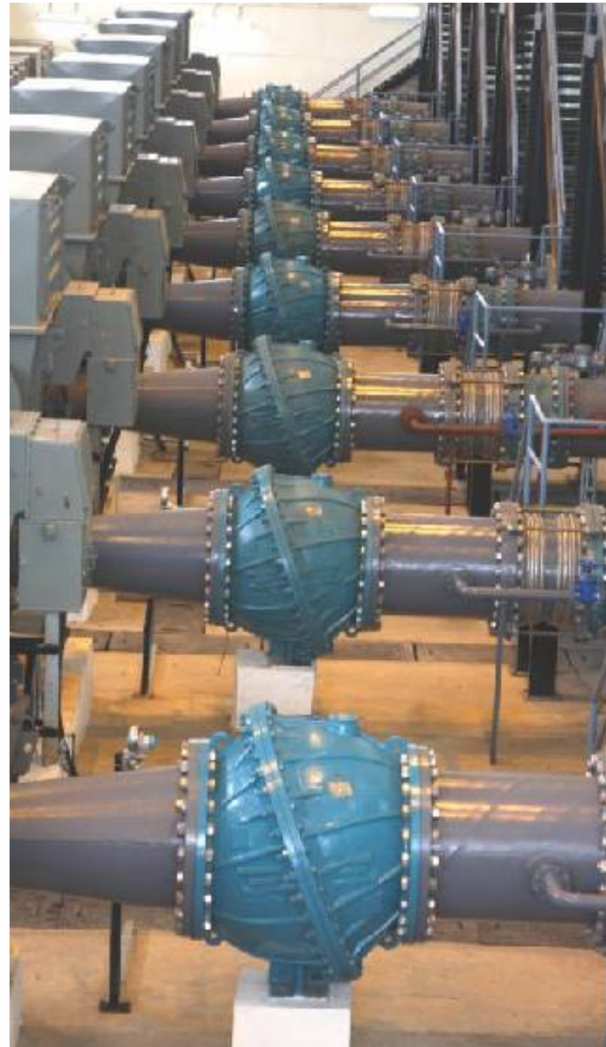
500 MLD Water Supply Pumphouse in Bangalore