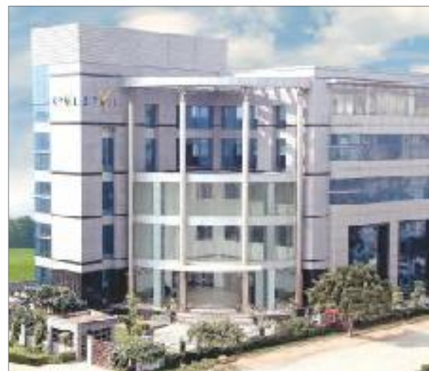
SPML Building, Gurgaon, Haryana