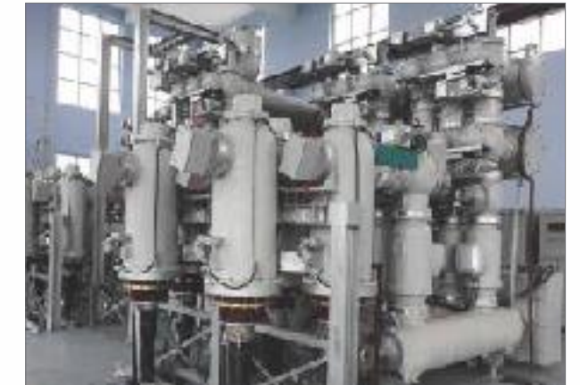
220 kV GIS Substation, Alipurduar, West Bengal