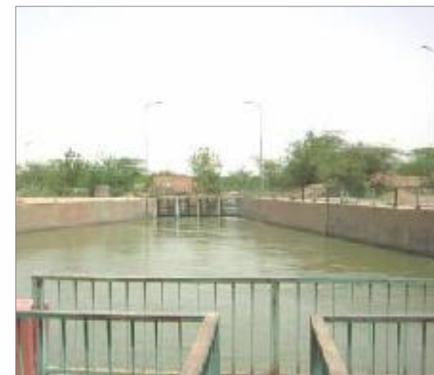
Rajiv Gandhi lift Canal in Rajasthan