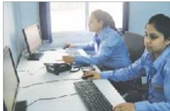
Customer Service Centre in Delhi