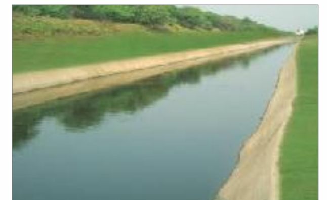
Sripada Sagar Lift Irrigation, Telangana

Water shortage is a big problem for India which still relies on monsoon rains for much of its agricultural produces. SPML plays a significant role in the construction of dams, canals, barrages, lift irrigation and micro irrigation to bring water to increase the irrigated area and cater the water needs of the crops to yield good agriculture produce.