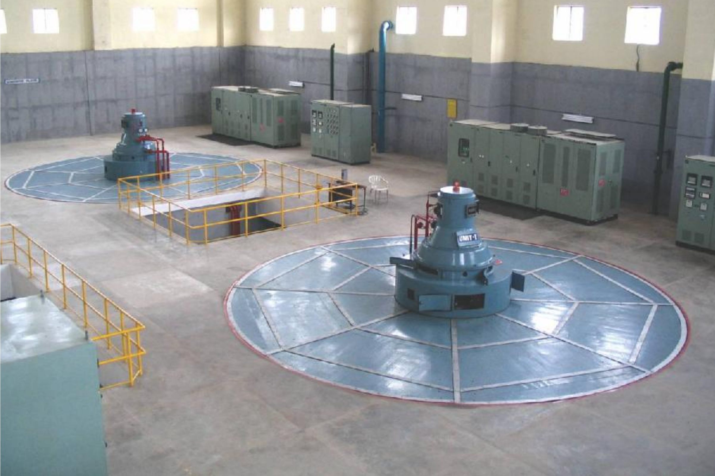
Generator Unit at 20 MW, Hydro Power Project, Kabini, Karnataka