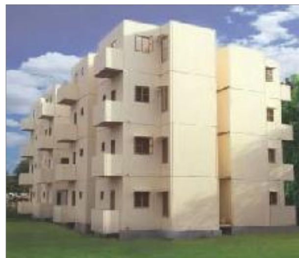
Low Cost Housing, Bangalore